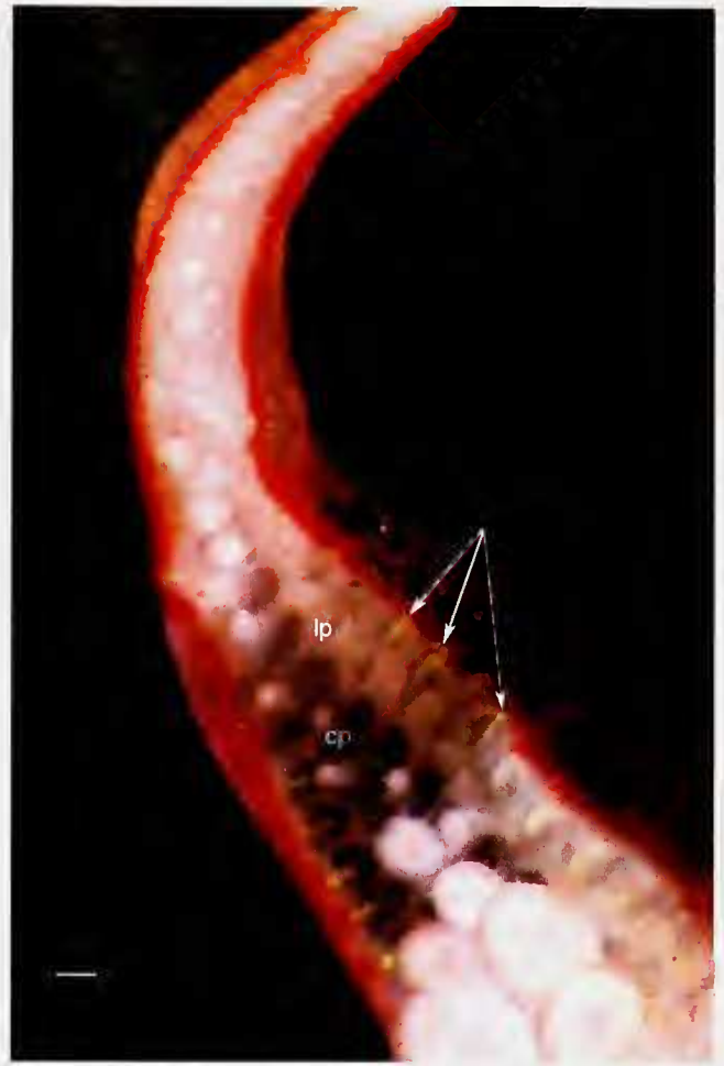
Figure 3. Arm tip of a living specimen of Vampyroteuthis infernalis , showing the distal light-producing region, and patches of small, green particles in the lateral plates that are associated with the luminous ejecta. cp = central plate; lp = lateral plate; scale bar = 1 mm; the arrows point to patches of iridescent particles that are not present after an extensive luminous cloud has been created.

Given a strong contact stimulus to the arms or body, the arm tips exuded a viscous fluid containing small glowing particles. As the arms swept up over the head and mantle, the particles dispersed, enveloping the animal in a luminous cloud (Fig. 4). To all observers, the light from the cloud was much dimmer than that of the fin lights and arm tips, but we were unable to measure its intensity. The number of particles released varied from a few dozen to several hundred, usually related to the strength of the stimulus. Cloud luminescence persisted for 2 to 3 min, and individual particles glowed for as long as 9 min (Hunt, 1996). Once the particles had gone dark, stirring the water did not re-initiate luminescence. After several such displays, production of the luminous fluid ceased, and while the arm tips could still be